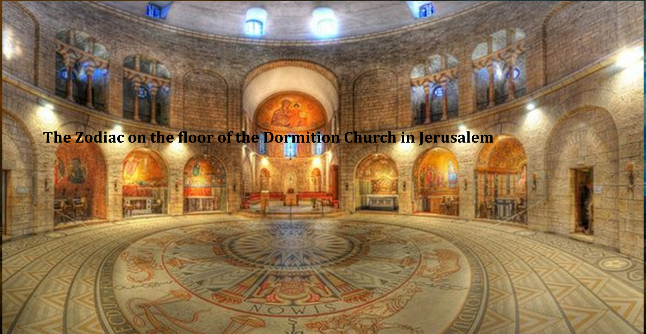
The Zodiac on the floor of the Dormition Church in Jerusalem